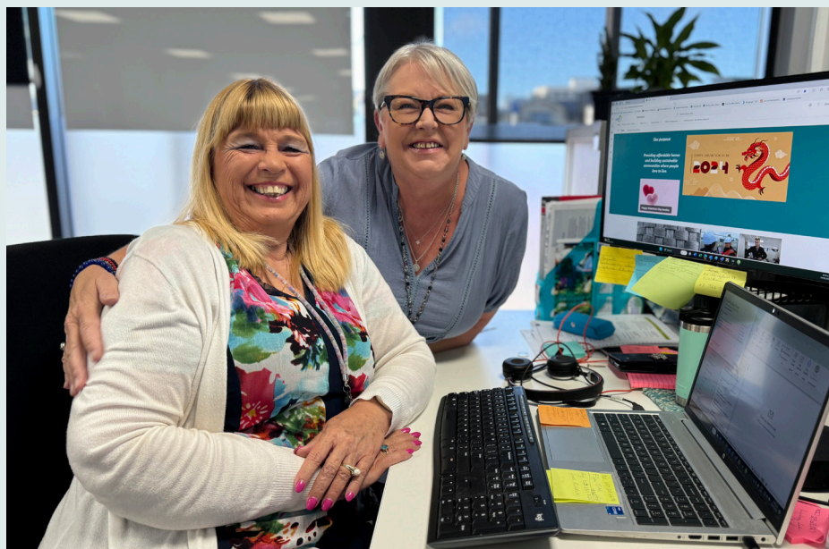
ŌCHT's call centre team answers more than 25,000 calls a year.

They also connect people with our employment coach, our whanau support worker and our digital coaching service. If you have a question about any of these services,