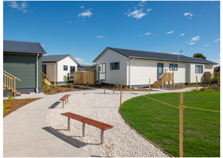
Homes sit beside communal green space at Reg Stillwell Place.