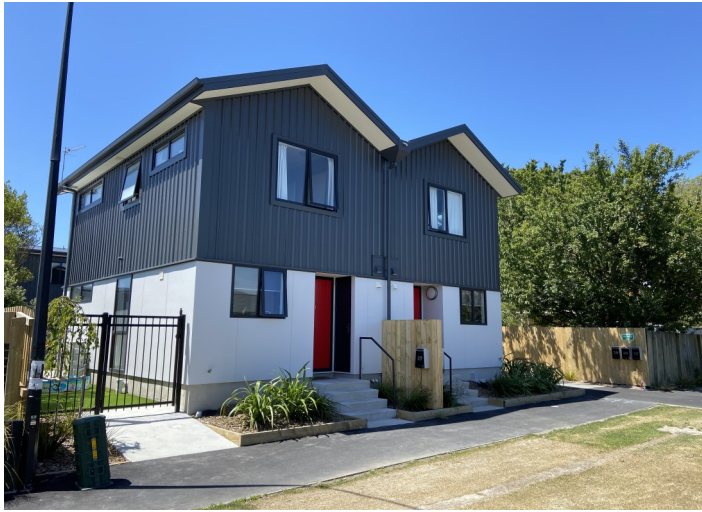
Charles St was ŌCHT's first Homestar 6 development.