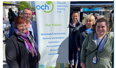
ŌCHT helped Housing First Christchurch tackle homelessness in the city.