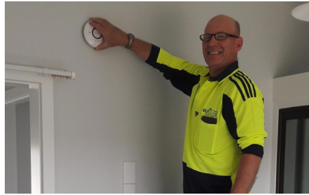
We started a new programme to add more smoke detectors to our homes.