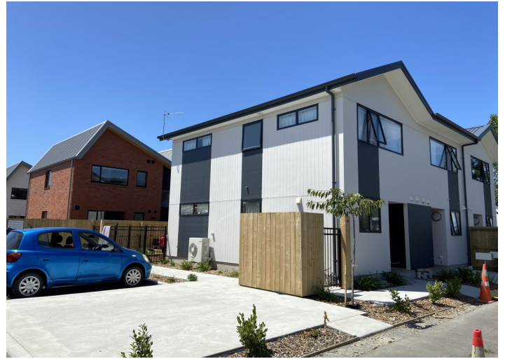
Hastings St East sits in front of our Brougham St development.