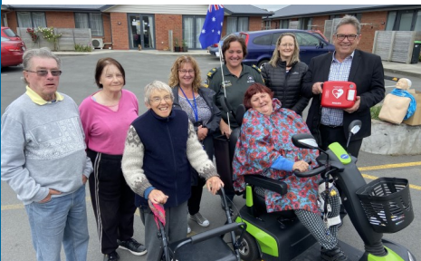
St John gifted AEDs to many ŌCHT communities, including Knightsbridge Lane.