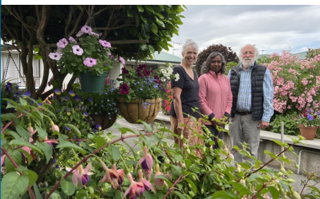
The annual ŌCHT Garden Awards will bookend a year disrupted by Covid-19.