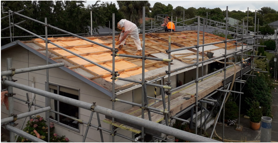
The roofing iron removed, insulation foam is sprayed on a home at Forfar Courts as part of the Warm & Dry Initiative. More homes will get more insulation into the new year.