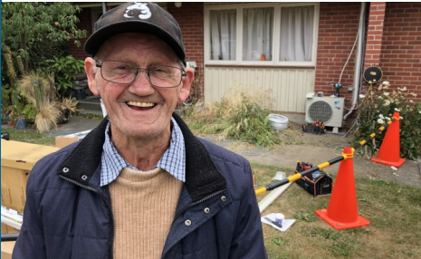
Nearly 2200 heat pups were installed in homes as part of the Warm & Dry Initiative.