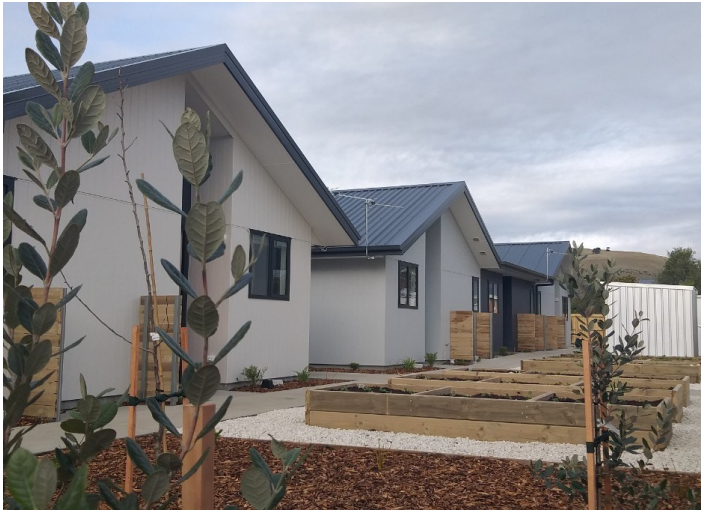
Gardens provide shared spaces at Tiwaiwaka Lane.