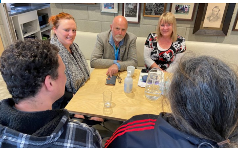
Job Club, part of ŌCHT's employment service, will keep supporting tenants into work in 2021.