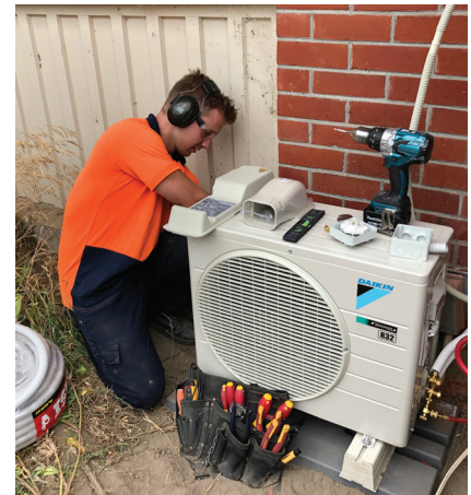
Contractors have started work on the scoping and installation of heat pumps at Glue Place.

If you have any queries about the process, please get in touch with your Tenancy Manager.