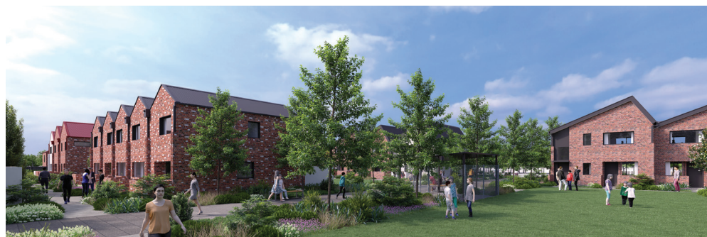
Brougham Street Development - Opening Early 2021