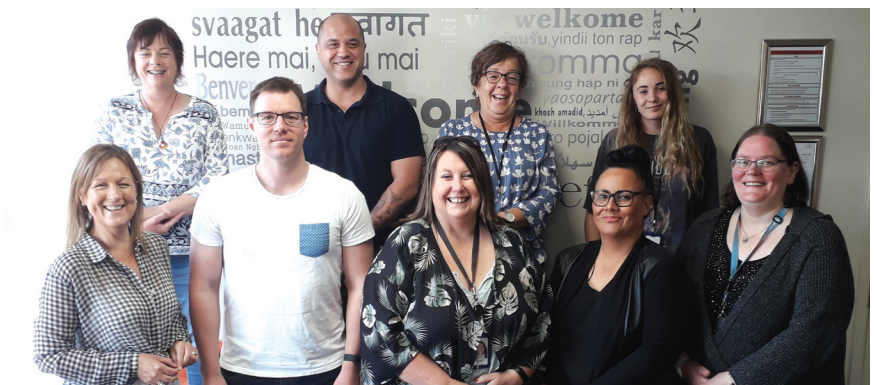
Meet the OCHT Maintenance and Customer Service Team