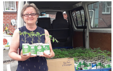
Happy tomato plant recipients