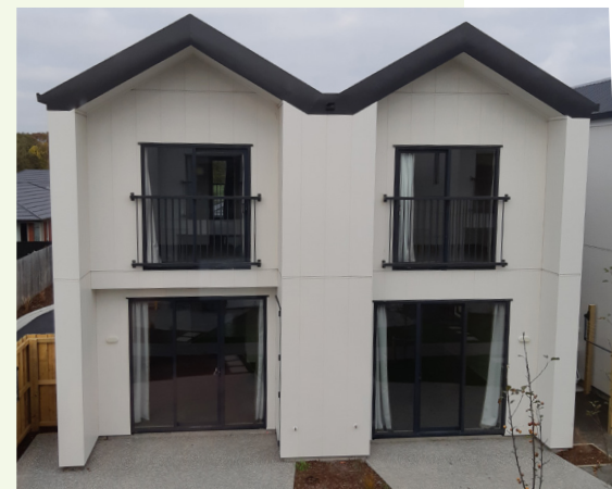
Lesley Keast Place Complex