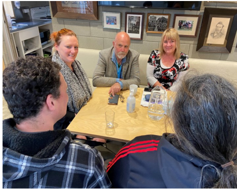
Job Club connects people with support every Monday morning.

Tenants get help identifying their skills, preparing CVs and even getting