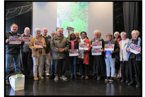
Certificate winners celebrate their success at last year's Garden Awards.

gardens. They'll look for healthy plant growth; tidy presentation and a lack of weeds; plant colour and, if edible gardens are your thing, a wealth of healthy vegetables.