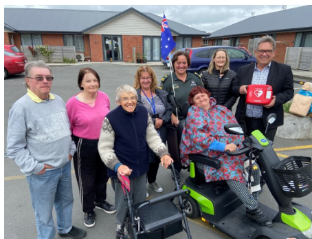
There’s a new AED at Knightsbridge Lane.

The St John Christchurch Area Committee donated AEDs for Knightsbridge Lane (Aranui), Bridgewater Courts (South Brighton), and Reg Stillwell Place (New Brighton).